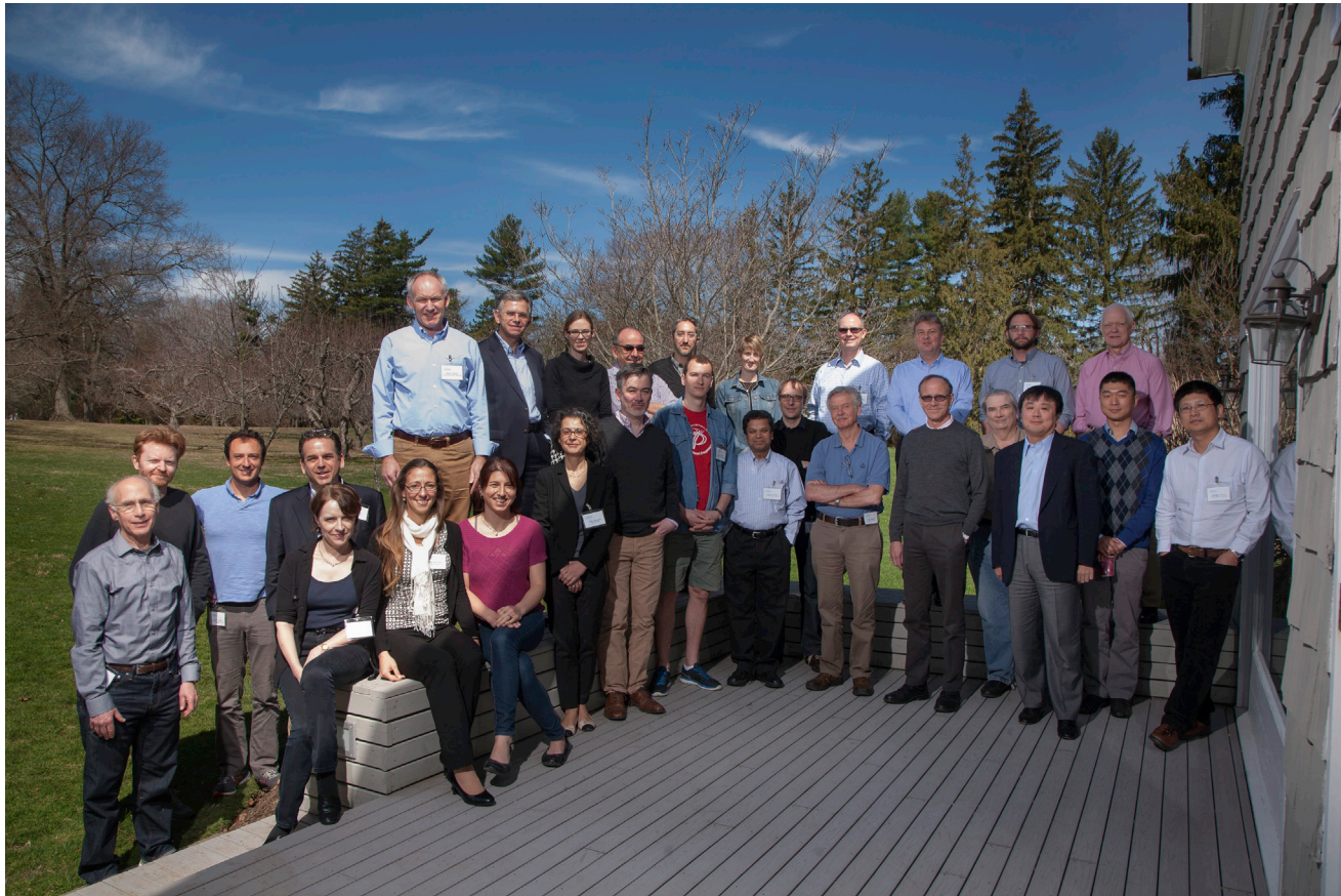
Figure 2. Banbury Meeting Attendees

for naive human pluripotency, ultimately yielding an improved combination of five kinase inhibitors (5i/L/FA) that induces and maintains OCT4 distal enhancer activity when applied directly to conventional hESCs (Theunissen et al., 2014). Using these optimized conditions, his group demonstrated direct conversion of primed to naive ESCs in the absence of transgenes and isolation of novel hESCs from human blastocysts. They noted, however, that naive hESCs showed upregulated XIST and evidence of X inactivation, raising the possibility that X inactivation in naive stem cells in mouse and human may be different. Critically, transplantation of GFP-positive human naive hESCs into mouse blastocysts yielded no GFP-positive E10.5 embryos, either by their original method ( n = 860 embryos) or by published methods (Gafni et al., 2013) ( n = 436+ embryos). PCR for human mitochondria is a more sensitive assay, identifying even the presence of 1/10,000 human cells, but this also failed to detect mouse-human chimerism. Although the generation of interspecies chimeras by injection of human ESCs into mouse morulae was proposed as a stringent assay for naive human pluripotency (Gafni et al., 2013), the assay may be too inefficient for use as a routine